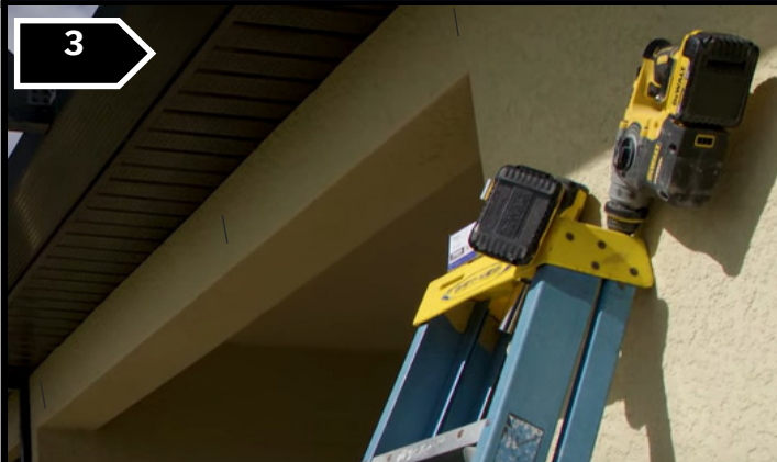
Mark Wall For Bracket Placements