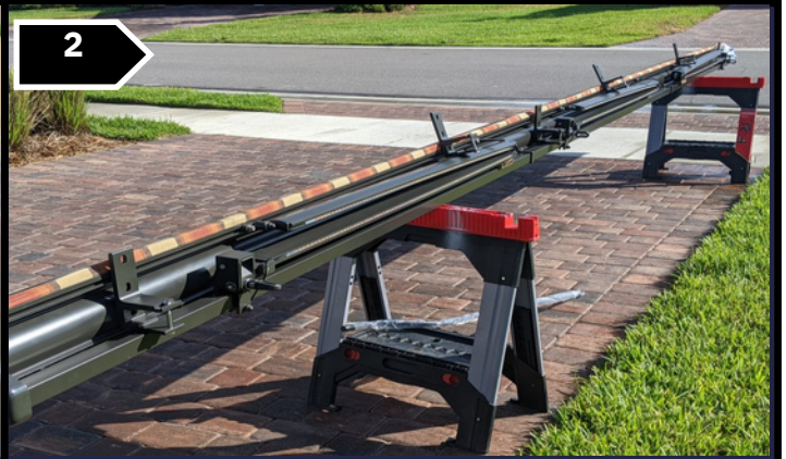
Mock Up Brackets 18" From Ends / 6-12" From Shoulders