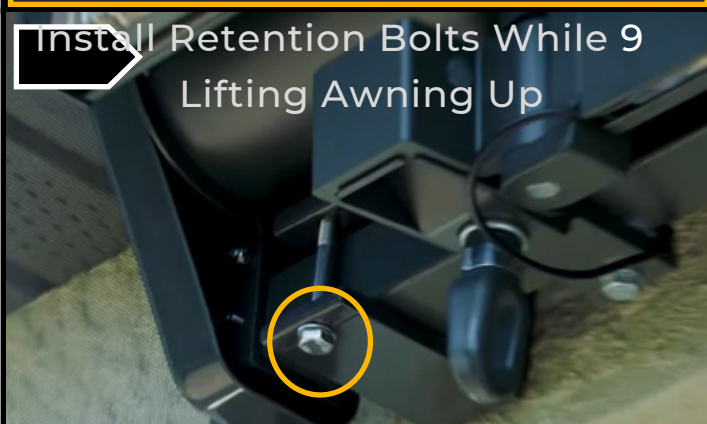
Install Retention Bolts While Lifting Awning