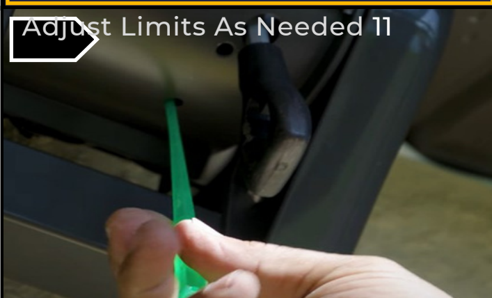
Adjust Limits As Needed 11