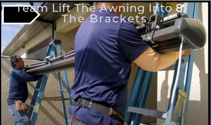
Team Lift The Awning Into The Brackets