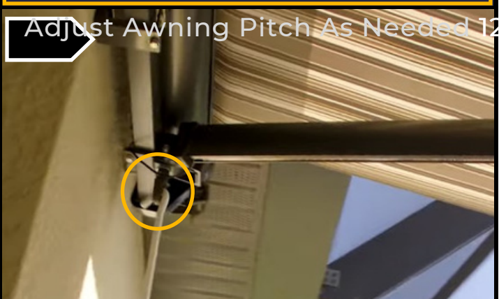
Adjust Awning Pitch As Needed 12