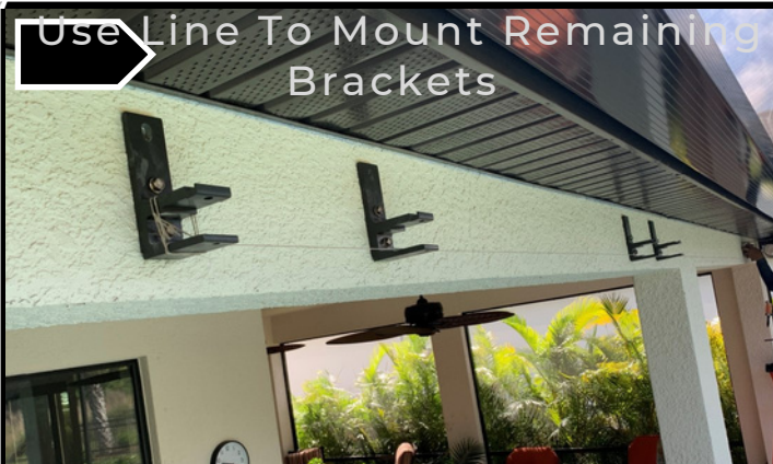
Use Line To Mount Remaining Brackets