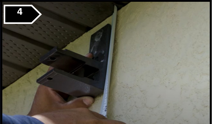
Place Bracket Bottom 9 Inches or More From Soffit