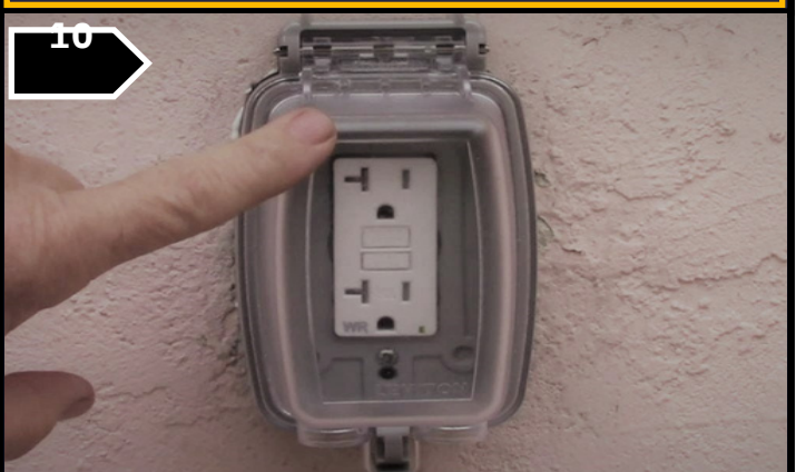
10 Connect to GFCI Protected Power Outlet